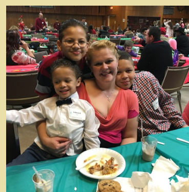
Time to plan for Special Love's Holiday Bash on December 3. A perfect start to the festive season!

March 9-11, 2018 | BRASS Weekend | Get that BRASS feeling when siblings convene at camp for bonding (i.e., yucking it up) in the early spring. Be prepared for loads of fun, brothers and sisters. 4-H Center, Front Royal, VA.