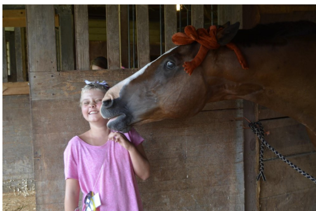
Many campers spend smile-filled hours with their favorite horses

Love's campers had the chance to take their first