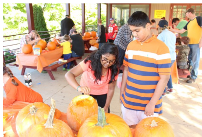
Top: Pumpkin-carving mania at Octoberfest

117 Youth Development Court | Winchester, VA 22602 31 Center Drive, Box 2062 | Bethesda, MD 20892 888.930.2707 | www.speciallove.org