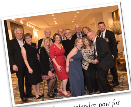
Mark your calendar now for Special Love's Casino Royale on April 13, 2018!

Special Love's good friends at the International Brotherhood of Electrical Workers Local 26 are planning for their 7th (yes, 7th!) exciting poker run through the scenic byways of Maryland and Virginia. Riders are welcome — by bike or by car — and so are sponsors! www.ibewlocal26.org