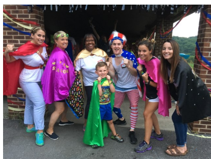
Bottom: The cape-clad Washington REIT team powers up SuperHero Day at Camp Fantastic.